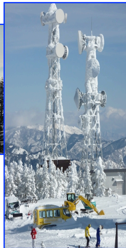
Shiga Kogens Highest Point

Hi, just a sample of some of our family photos in Shiga Kogen Japan which is accessed from Nagano. We had a great time, with 3 days of pure powder blizzards up to 4 feet deep and then 4 days of brilliant sunshine.