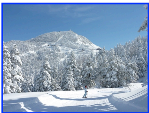
Cross trail looking at Shiga Kogens